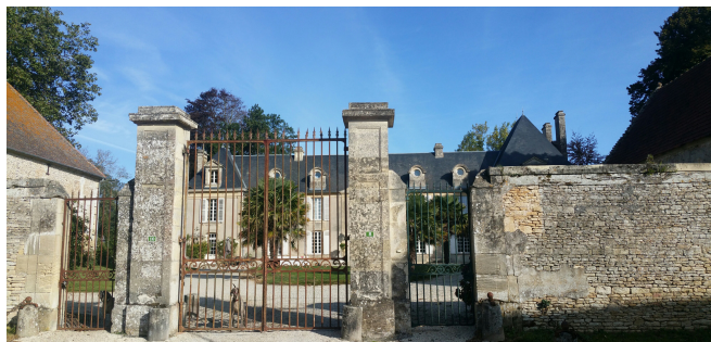
Manoir de Colomby

Turn right and go along chemin de la Cachette , and then turn left onto chemin vert and chemin du pressoir . Turn right to go back to the roundabout.