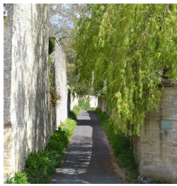
Rue de Coursanne - Chemin de la trappe