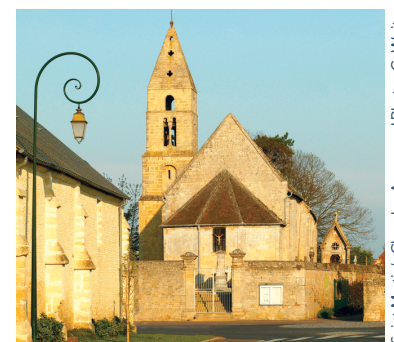
Saint Martin's Church - Anguerny

On the rooftops, there are slopes known as « cat-stepped » or « crow-stepped » gables. These sloping gable walls are described as « saw-toothed » and are made up of small steps. They are simply aesthetic architectural elements.