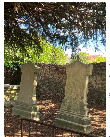
Protestant cemetery

Go up rue des Mutrelles as far as the square, cross it and take the road to the right. Turn right on to chemin des Parets and continue as far as the road. Continue to your right and return to Bud Hannam square.