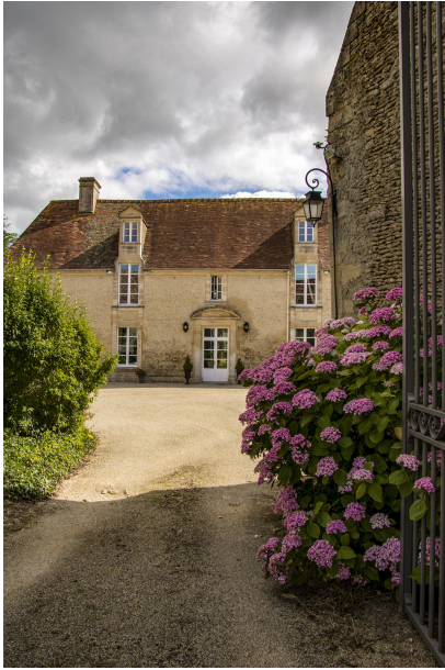
Nice stone house in Caen | Photo : C. Marcello

Leaving the town hall, turn left and cross route de Courseulles.