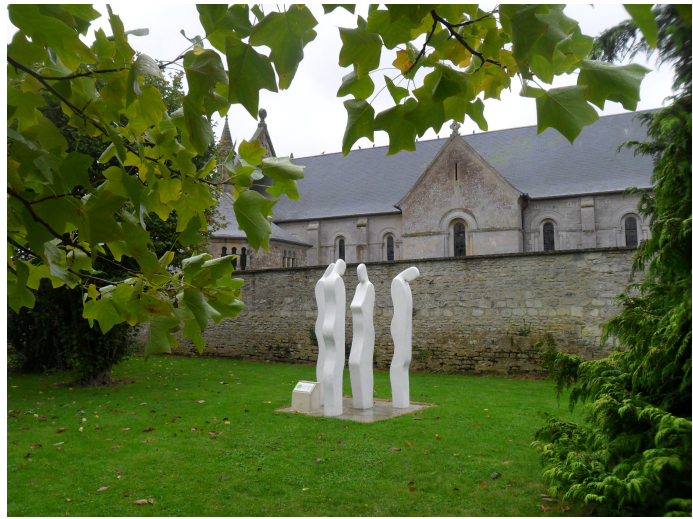
Work by Serge Saint

Continue on route de Courseulles as far as the crossroads.