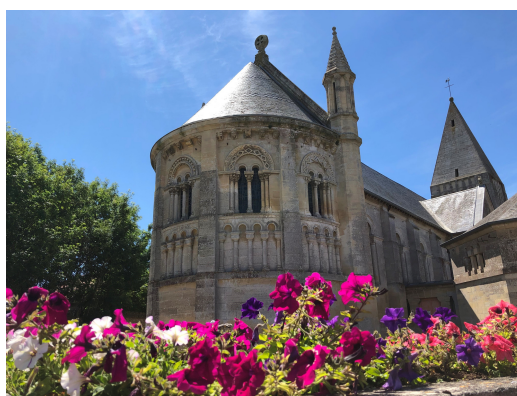
Church of Saint Georges | Photo : M. Lelandais

Originally, it was a dependency of the Abbey of Saint Wandrille, owned by the Benedictine monks. It has a typical Romanesque bell tower porch from the 12th century. The building's choir houses a priceless wooden Christ from the 13th century. The bell tower, which was destroyed by bombing on 6 June 1944, was shortened by two metres during its reconstruction. (Open every 1st Sunday of the month from 10:00am to 5:00pm).